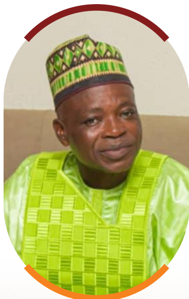
HON. JOHN ALI ADOLF NBURDIBA REGIONAL MINISTER, NORTHERN REGION