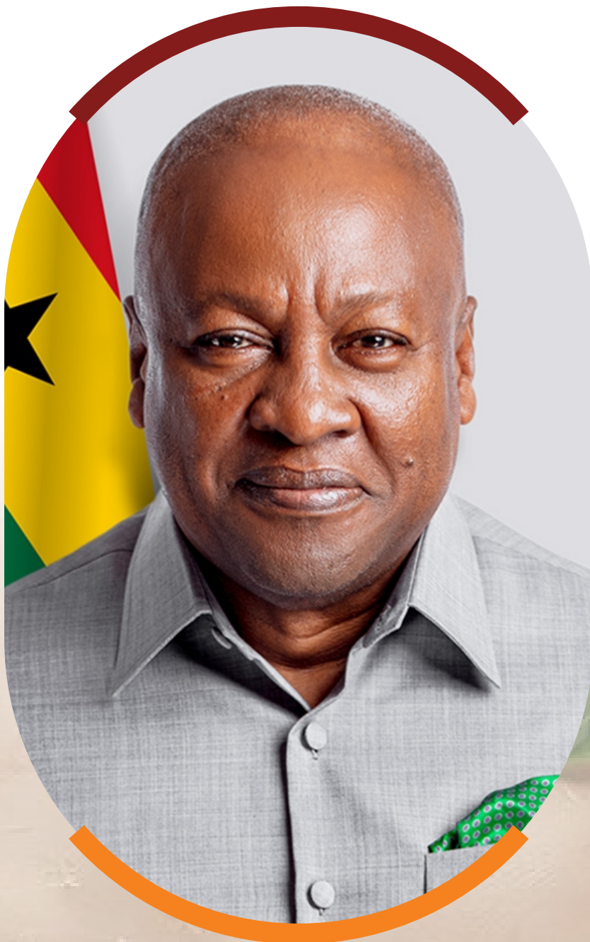
HIS EXCELLENCY JOHN DRAMANI MAHAMA PRESIDENT OF THE REPUBLIC OF GHANA